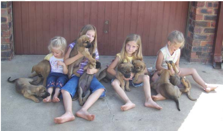
What do you need to make an already busy household even busier? Try 8 puppies! They are just about old enough to give away.