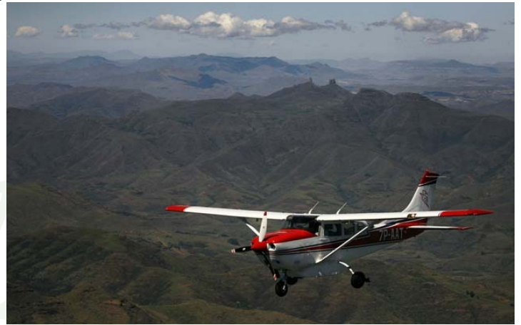
Lesotho is a beautiful place to fly!