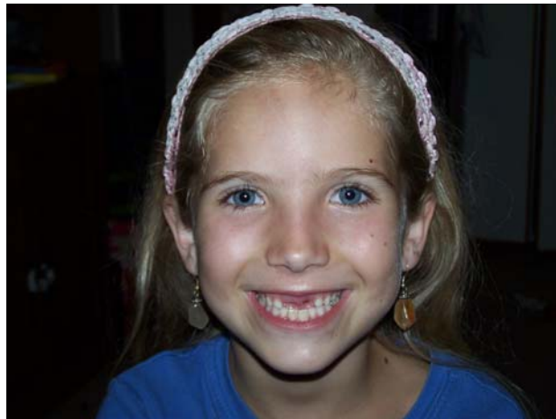
All I want for Christmas is my 2 front teeth!