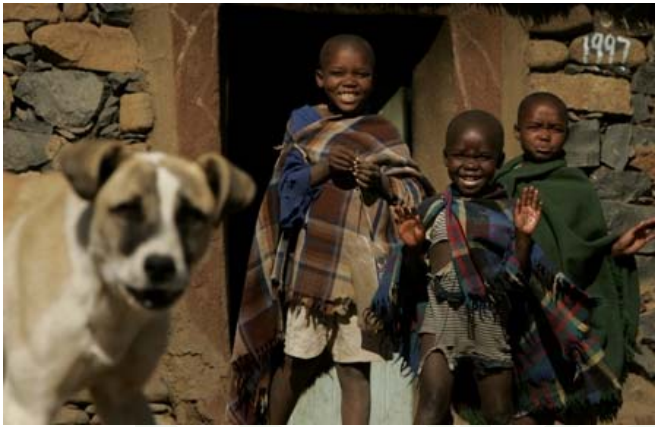
Some of the kids in a village called Methaleneng