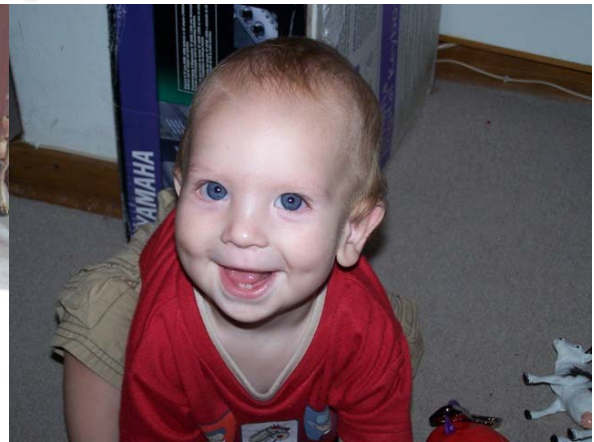
Here is our happy boy, always wearing a smile

Please take the Prayer Card that is included here and place it where you will remember to pray for us and our kids. We could not do it without your prayers!