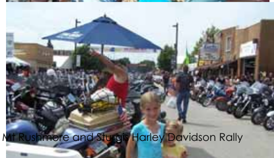
MT Rushmore and Sturgis Harley Davidson Rally